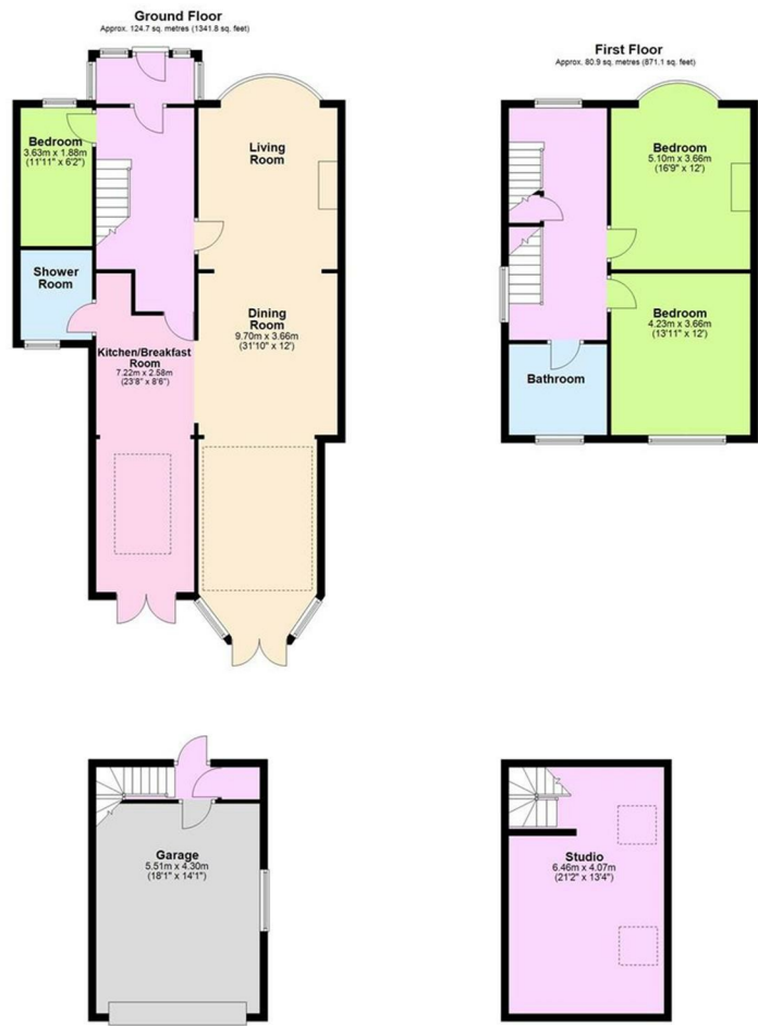
Total area: approx. 251.9 sq. metres (2711.6 sq. feet)